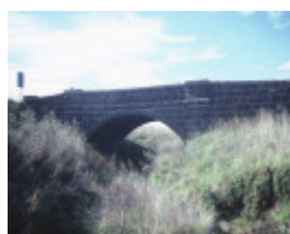
1 bridge over youls creek woolsthorpe side view jun1984