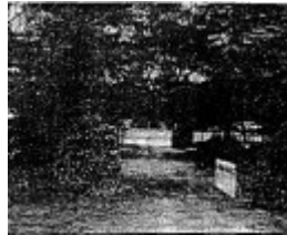
Cemetery Precinct - view of cemetery looking east - 1983 Buninyong Conservation Study