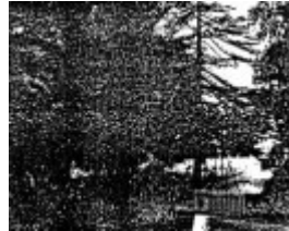
Cemetery Precinct - view of cemetery looking north to cemetery gates - 1983 Buninyong Conservation Study