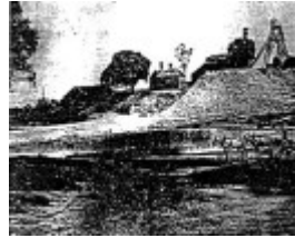
Imperial Mine Conservation Precinct - Imperial Mine - 1983 Buninyong Conservation Study