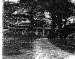
Netherby, 606 Warrenheip Street, Buninyong - 1983 Buninyong Conservation Study