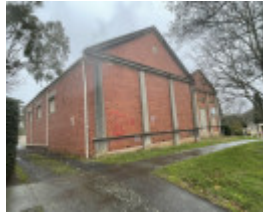
Buninyong Masonic Hall