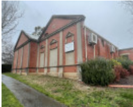
Buninyong Masonic Hall