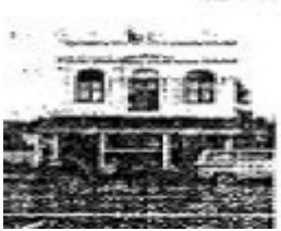
Former Eagle Hotel, 507 Warrenheip Street, Buninyong - 1983 Buninyong Conservation Study