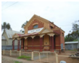
WYCHEPROOF COURT HOUSE SOHE 2008