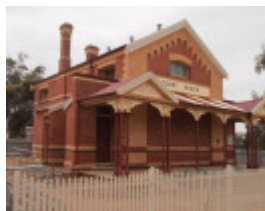
H1656 WYCHEPROOF COURT HOUSE LHA 2015 2.JPG