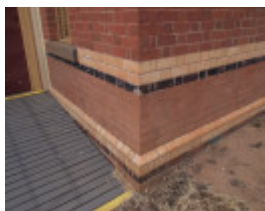
H1656 WYCHEPROOF COURT HOUSE LHA 2015 4.JPG