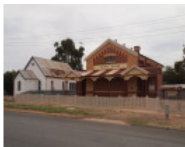
H1656 WYCHEPROOF COURT HOUSE LHA 2015 1.JPG