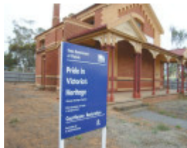
WYCHEPROOF COURT HOUSE SOHE 2008