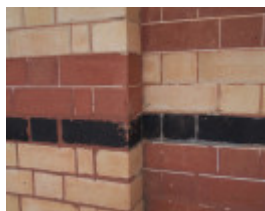
H1656 WYCHEPROOF COURT HOUSE LHA 2015 5.JPG