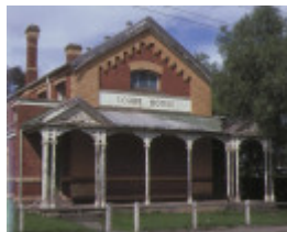
1 wycheproof court house front elevation sep1984