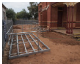
H1656 WYCHEPROOF COURT HOUSE LHA 2015 3.JPG