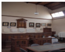
H1656 WYCHEPROOF COURT HOUSE LHA 2015 6.JPG