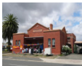
FREEMASONS HALL, ZETLAND LODGE SOHE 2008