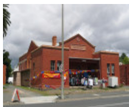
FREEMASONS HALL, ZETLAND LODGE SOHE 2008