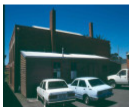
H01988 kyneton masonic hall jan2002 rear