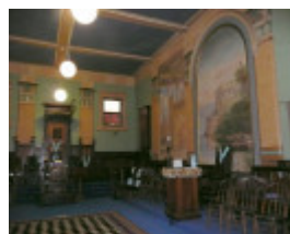
FREEMASONS HALL, ZETLAND LODGE SOHE 2008