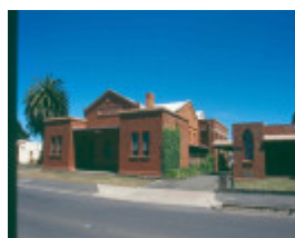
H01988 kyneton masonic hall jan2002 front