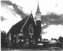
St Bernard's Church, Presbytery and Parish Centre,