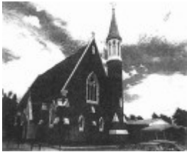
St Bernard's Church, Presbytery and Parish Centre,