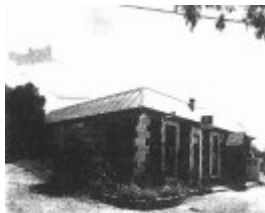
Plough Inn Hotel.