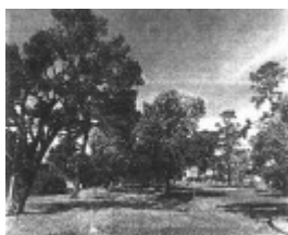
Plough Inn Hotel.