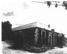
Plough Inn Hotel.