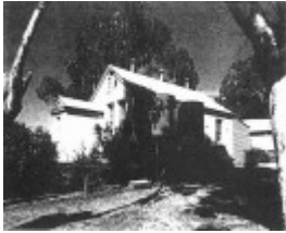
Coimadai Primary School. No.716