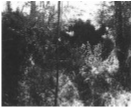
Broken Back Mine (disused) and Black Snake Mine