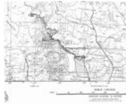
Broken Back Mine (disused) and Black Snake Mine