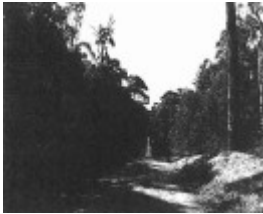
Ambler Lane (FWD), Break Neck Gully (North of O'Brien's Crossing).