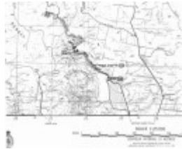
Ambler Lane (FWD), Break Neck Gully (North of O'Brien's Crossing).