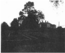
Bacchus Marsh Lawn Tennis Club Inc.