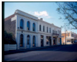
h02039 kyneton piper street shops exterior