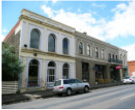
SHOPS SOHE 2008