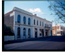
h02039 kyneton piper street shops exterior