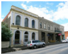
SHOPS SOHE 2008