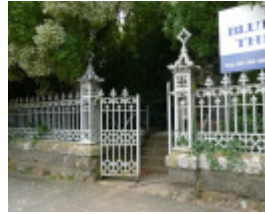
KYNETON ARTS CENTRE (FORMER CONGREGATIONAL CHURCH AND SUNDAY SCHOOL) SOHE 2008