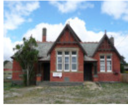
KYNETON ARTS CENTRE (FORMER CONGREGATIONAL CHURCH AND SUNDAY SCHOOL) SOHE 2008