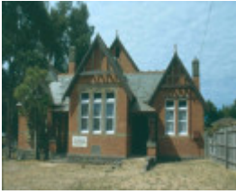
H01989 former congreg sunday school kyneton