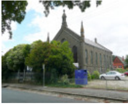
KYNETON ARTS CENTRE (FORMER CONGREGATIONAL CHURCH AND SUNDAY SCHOOL) SOHE 2008