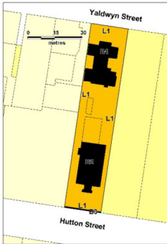
H01989 former congreg sunday school kyneton plan