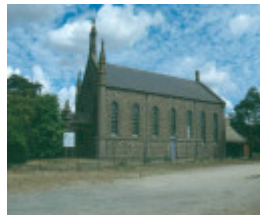
H01989 former congreg church kyneton1