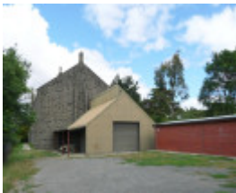
KYNETON ARTS CENTRE (FORMER CONGREGATIONAL CHURCH AND SUNDAY SCHOOL) SOHE 2008