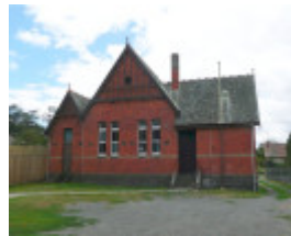
KYNETON ARTS CENTRE (FORMER CONGREGATIONAL CHURCH AND SUNDAY SCHOOL) SOHE 2008