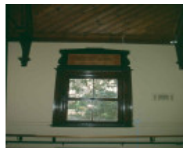
H01989 former congreg sunday school interior