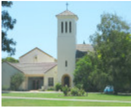
COMMUNITY OF THE HOLY NAME AND RETREAT HOUSE SOHE 2008