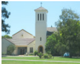
COMMUNITY OF THE HOLY NAME AND RETREAT HOUSE SOHE 2008