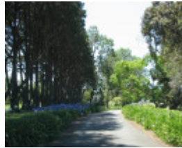
COMMUNITY OF THE HOLY NAME AND RETREAT HOUSE SOHE 2008