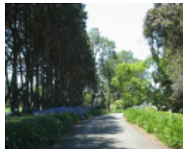
COMMUNITY OF THE HOLY NAME AND RETREAT HOUSE SOHE 2008