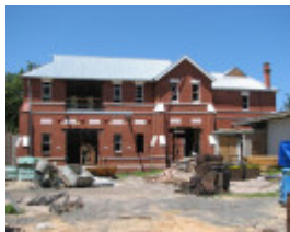
COMMUNITY OF THE HOLY NAME AND RETREAT HOUSE SOHE 2008