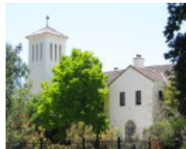
COMMUNITY OF THE HOLY NAME AND RETREAT HOUSE SOHE 2008