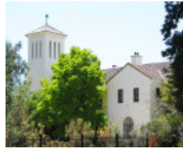
COMMUNITY OF THE HOLY NAME AND RETREAT HOUSE SOHE 2008