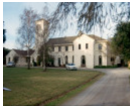
H02008 1 chs community house june 2002 h2008