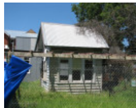
COMMUNITY OF THE HOLY NAME AND RETREAT HOUSE SOHE 2008