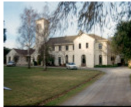
H02008 1 chs community house june 2002 h2008