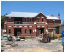
COMMUNITY OF THE HOLY NAME AND RETREAT HOUSE SOHE 2008