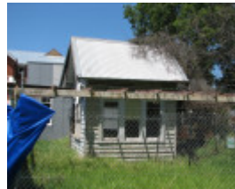
COMMUNITY OF THE HOLY NAME AND RETREAT HOUSE SOHE 2008