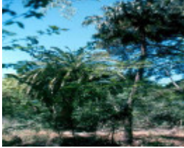
h00070 h0070 riddells creek nursery