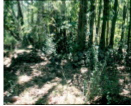
h00070 h0070 riddellscreeknursery retaining wall