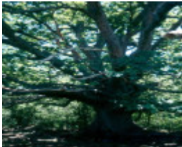
h00070 h0070 riddellscreeknursery white oak