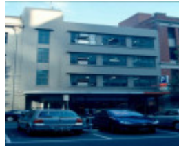
H02001 former victoria carpark russell st1