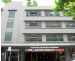
FORMER VICTORIA CAR PARK SOHE 2008