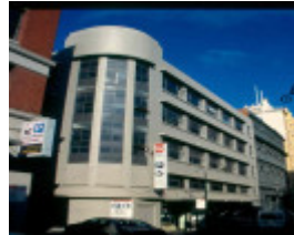
H02001 1 former victoria carpark little collins