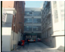
H02001 former victoria carpark little collins