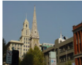
h02001 former victoria carpark skyline