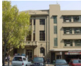
Former Victoria Carpark