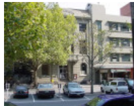
h02001 former victoria carpark