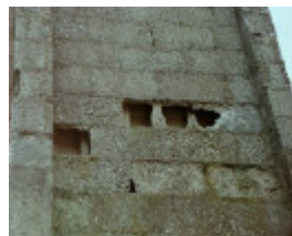
Snake Valley Wesleyan Tower Deterioration