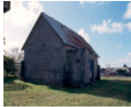
H02007 snake valley wesleyan rear vestibule 02