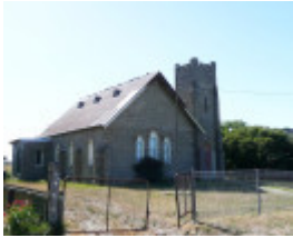
WELSH METHODIST CHURCH SOHE 2008