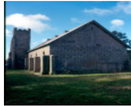
H02007 snake valley wesleyan rear 02