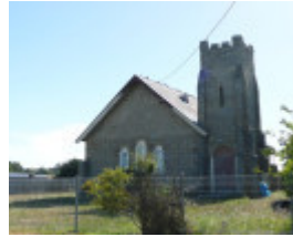
WELSH METHODIST CHURCH SOHE 2008