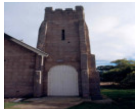
H02007 snake valley wesleyan tower front 02