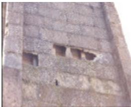
H02007 snake valley wesleyan tower detail 02