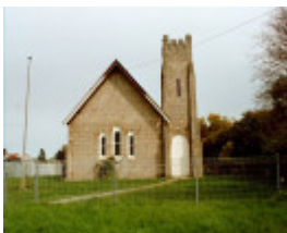
Snake Valley Wesleyan Front