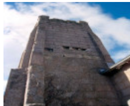
H02007 snake valley wesleyan tower rear 02