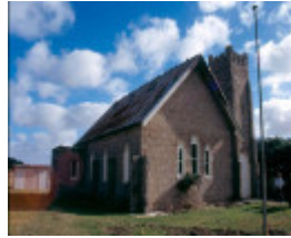
H02007 snake valley wesleyan front 02