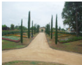
WHITE HILLS BOTANIC GARDENS SOHE 2008