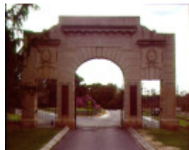
Arch of Triumph, White Hills Botanic Gardens