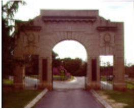
Arch of Triumph, White Hills Botanic Gardens