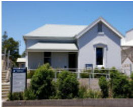
H543 orderly room residence