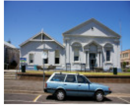
H543 orderly room gun room