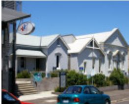
H543 orderly room residence kepler st1