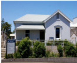
H543 orderly room residence