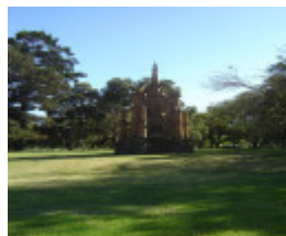
boer war memorial full view nov 06 jb