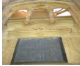
plaque3 boer war memorial stkilda rd jb