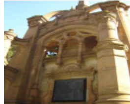
boer war memorial detail nov06 jb