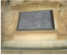
plaque1 boer war memorial st kilda rd nov06 jb