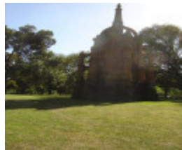
boer war memorial nov06 jb