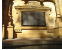
plaque2 boer war memorial stkilda rd2 nov06 jb