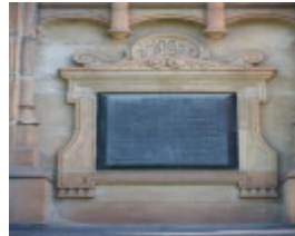
Victorian Mounted Rifles Memorial.jpg