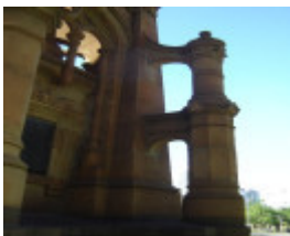
boer war memorial buttress Nov06 jb