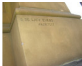
boer war memorial architects mark nov06 jb