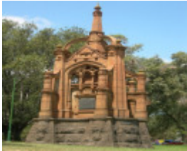
BOER WAR MONUMENT SOHE 2008