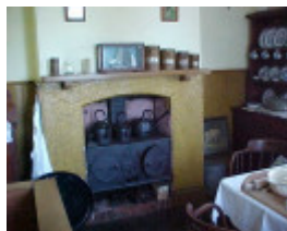
h01520 lady bay lighthouse complex kitchen jun04 pm1