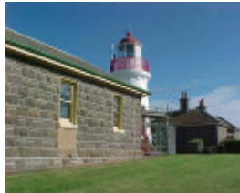
h01520 1 lady bay lighthouse complex chartroom jun04 pm1