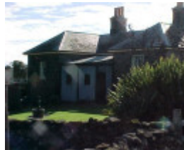
h01520 lady bay lighthouse complex cottage jun04 pm1