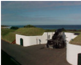
h01520 lady bay lighthouse complex battery jun04 pm1