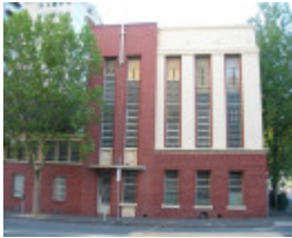
FORMER ROYAL AUSTRALIAN ARMY MEDICAL CORPS TRAINING DEPOT SOHE 2008