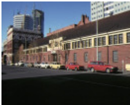
former royal australian army medical corps training depot a'beckett street melb front view 1990