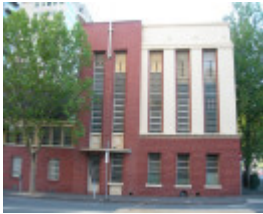
FORMER ROYAL AUSTRALIAN ARMY MEDICAL CORPS TRAINING DEPOT SOHE 2008