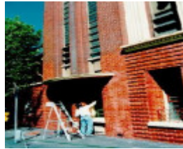
former royal australian army medical corps training depot a'beckett street melb facade detail