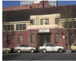
1 former royal australian army medical corps training depot a'beckett street melb front entrance 1990