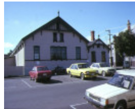
1 drill hall lyttleton street castlemaine front view