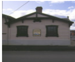
drill hall lyttleton street castlemaine front detail