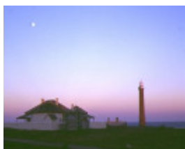
1 gabo island lightstation aug 99