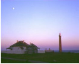
1 gabo island lightstation aug 99