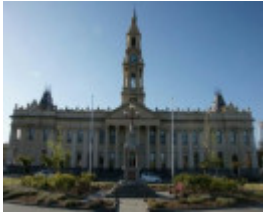
South Melbourne Boer War Memorial.jpg