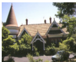
1 darnlee lansell road toorak front view