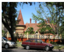
DARNLEE SOHE 2008