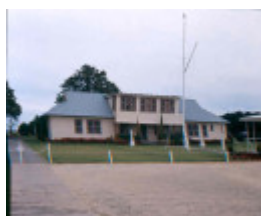
H01969 pt cook headquarters aug02 pm1