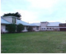
H01969 pt cook school of languages aug02 pm1