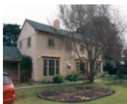
H01969 pt cook lukis house aug02 pm1