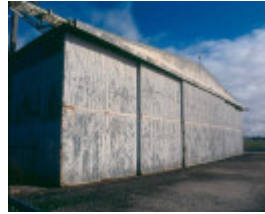
H01969 pt cook bellman hangar aug02 pm1