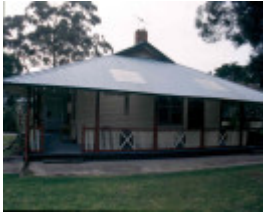
H01969 pt cook married quarters aug02 pm1