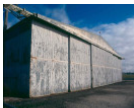
H01969 pt cook bellman hangar aug02 pm1