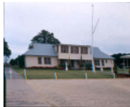
H01969 pt cook headquarters aug02 pm1