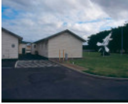
H01969 pt cook ww2 huts aug02 pm1