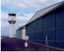
H01969 pt cook tower aug02 pm1