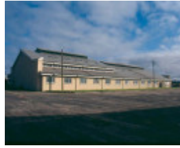
H01969 pt cook waterplane hangar aug02 pm1