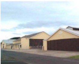
H01969 pt cook south tarmac1 aug02 pm1