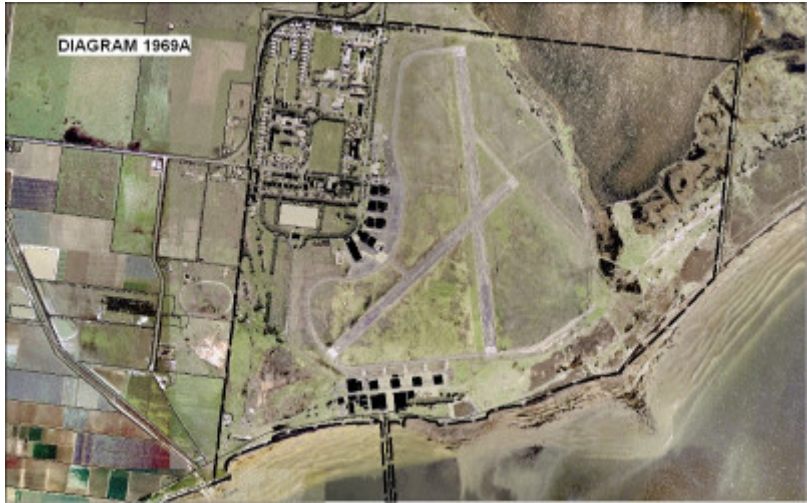
h01969 diagram 1969a