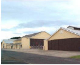
H01969 pt cook south tarmac1 aug02 pm1