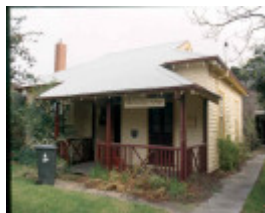
H01969 pt cook caretakers cottage aug02 pm1