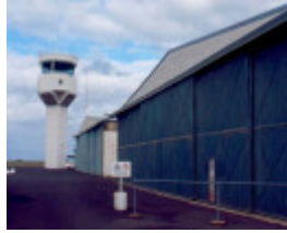
H01969 pt cook tower aug02 pm1