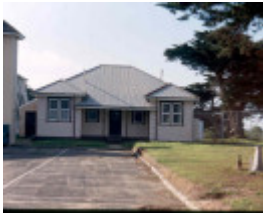
H01969 pt cook bldg100 aug02 pm1