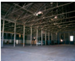
H01969 pt cook inside seaplane hangar aug02 pm1