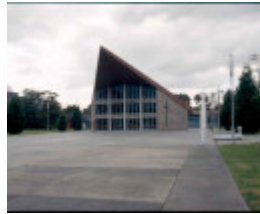
H01969 pt cook chapel aug02 pm1