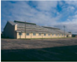
H01969 pt cook waterplane hangar aug02 pm1