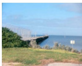
H01969 pt cook jetty aug02 pm1