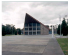
H01969 pt cook chapel aug02 pm1