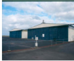
H01969 pt cook bellmans hangar aug02 pm1