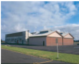
H01969 pt cook hangar store aug02 pm1