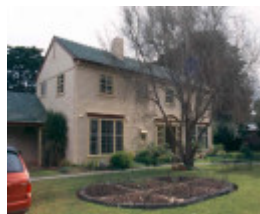
H01969 pt cook lukis house aug02 pm1