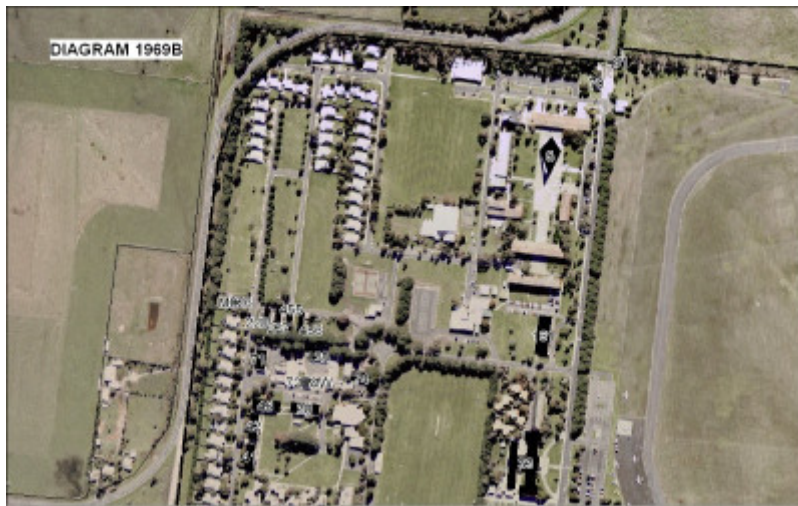
h01969 diagram 1969b