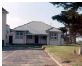
H01969 pt cook bldg100 aug02 pm1