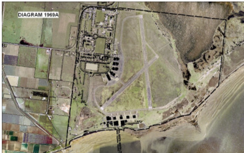
h01969 diagram 1969a