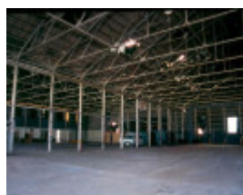
H01969 pt cook inside seaplane hangar aug02 pm1