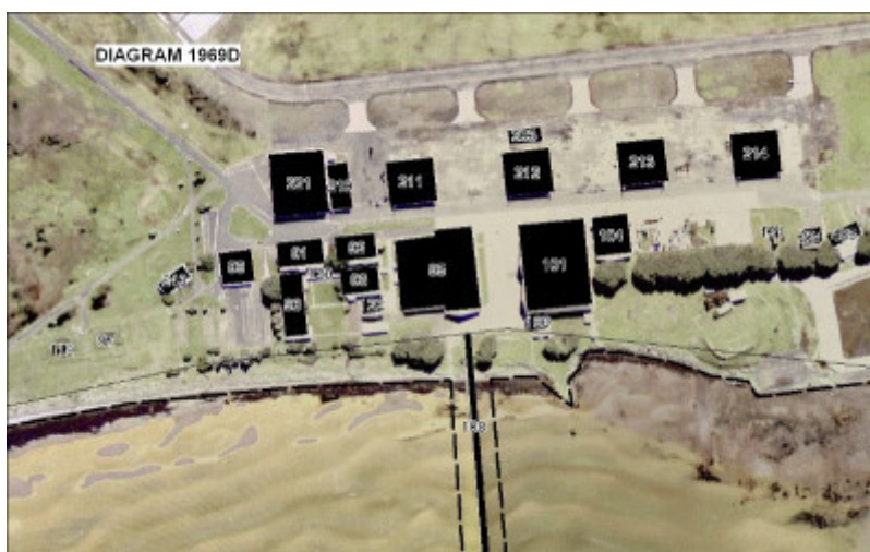
h01969 diagram 1969d