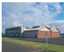
H01969 pt cook hangar store aug02 pm1