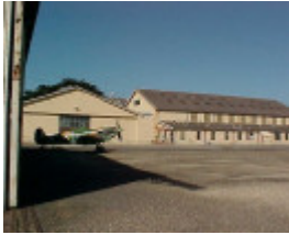
H01969 1 pt cook south tarmac spitfire sep02 pm1