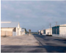
H01969 pt cook south tarmac aug02 pm1