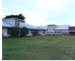
H01969 pt cook school of languages aug02 pm1