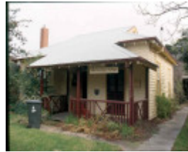
H01969 pt cook caretakers cottage aug02 pm1