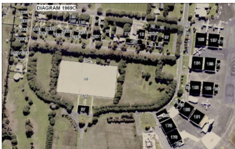
h01969 diagram 1969c