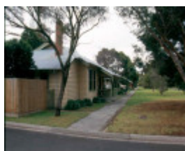
H01969 pt cook harmony row aug02 pm1