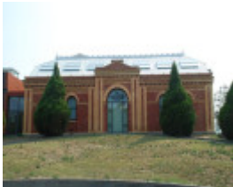
BENDIGO ART GALLERY SOHE 2008