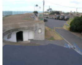
FORT GELLIBRAND SOHE 2008