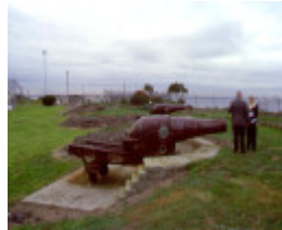
1 fort gellibrand point gellibrand williamstown gun emplacements pm2 july1999