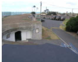
FORT GELLIBRAND SOHE 2008