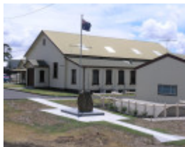
FORT GELLIBRAND SOHE 2008