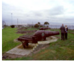
1 fort gellibrand point gellibrand williamstown gun emplacements pm2 july1999