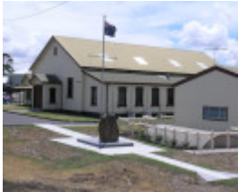
FORT GELLIBRAND SOHE 2008