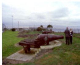
1 fort gellibrand point gellibrand williamstown gun emplacements pm2 july1999