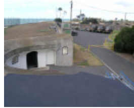
FORT GELLIBRAND SOHE 2008