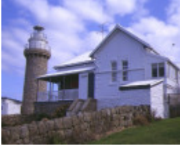
1 wilsons prom lightstation tower and headkeepers quarters aug 99