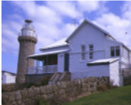
1 wilsons prom lightstation tower and headkeepers quarters aug 99