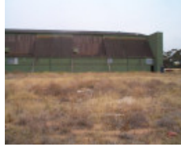
H01884 werribee satellite aerodrome2 feb2003