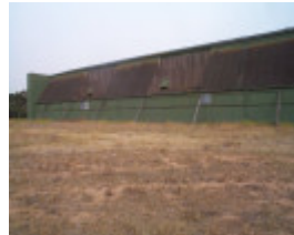
H01884 werribee satellite aerodrome4 feb2003