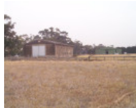
H01884 werribee satellite aerodrome site3