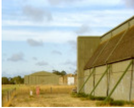
1 werribee satellite aerodrome mar00 pm1