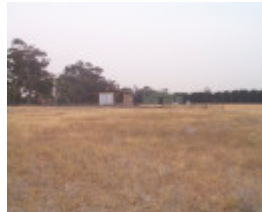
H01884 werribee satellite aerodrome site1