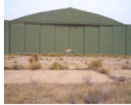
H01884 werribee satellite aerodrome feb2003