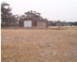
H01884 werribee satellite aerodrome site2