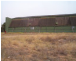
H01884 werribee satellite aerodrome3 feb2003