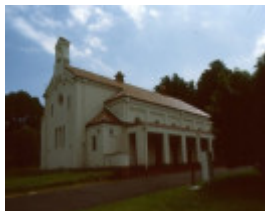
1 mont park ernest jones hall