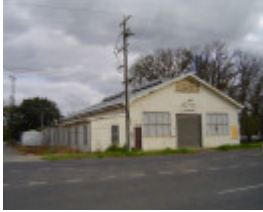
6168 Warragul Drill hall may07 ac 4