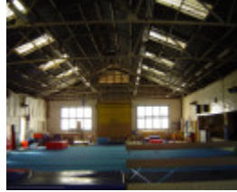
6168 Warragul Drill hall may07 ac 16