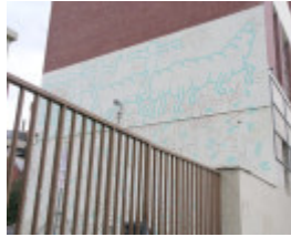
KEITH HARING MURAL SOHE 2008