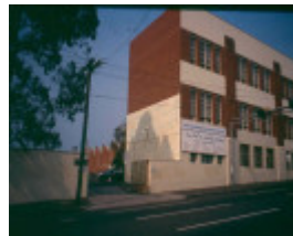
h02055 johnston st view