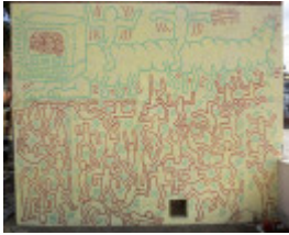
Haring Mural after conservation