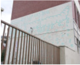
KEITH HARING MURAL SOHE 2008