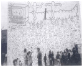
Keith Haring Mural Collingwood Making