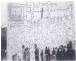
Keith Haring Mural Collingwood Making