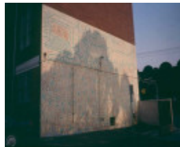
h02055 mural 3