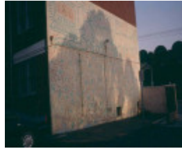
h02055 mural 2