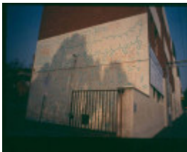
h02055 haring mural 1