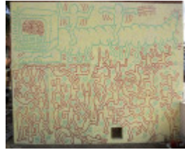
Haring Mural after conservation