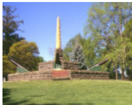
1 eureka monument view nov1999 db