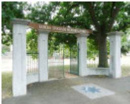
EUREKA HISTORIC PRECINCT SOHE 2008