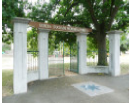
EUREKA HISTORIC PRECINCT SOHE 2008