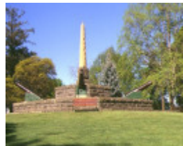
1 eureka monument view nov1999 db