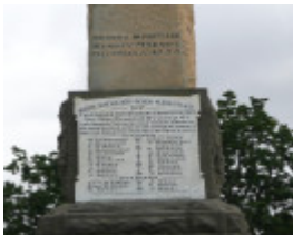
EUREKA HISTORIC PRECINCT SOHE 2008