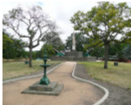
EUREKA HISTORIC PRECINCT SOHE 2008