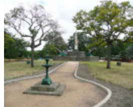
EUREKA HISTORIC PRECINCT SOHE 2008