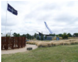
EUREKA HISTORIC PRECINCT SOHE 2008