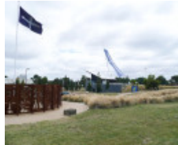
EUREKA HISTORIC PRECINCT SOHE 2008