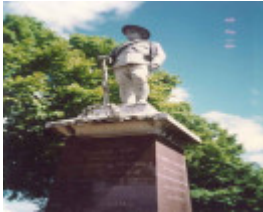
26784 Empire War Memorial