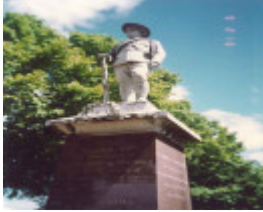
26784 Empire War Memorial