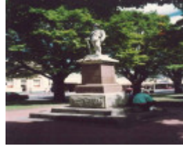
26784 Empire War Memorial 02