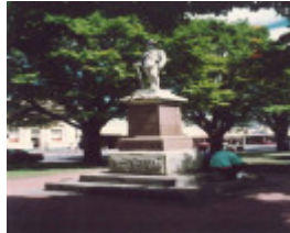
26784 Empire War Memorial 02