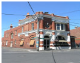
STATE SAVINGS BANK SOHE 2008