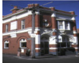
1 state savings bank ballarat street yarraville side view