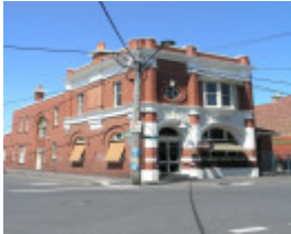
STATE SAVINGS BANK SOHE 2008