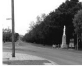
MONUMENT & TREES