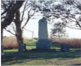
Cora L 1.jpg