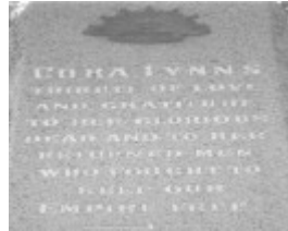
Cora L 2.jpg