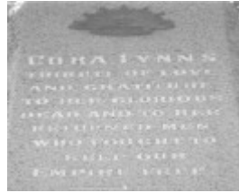
Cora L 2.jpg