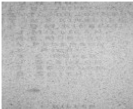
Cora L 4.jpg