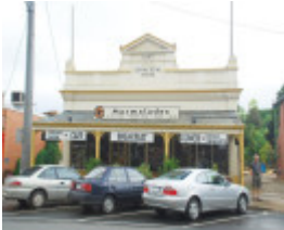
PURCELLS GENERAL STORE SOHE 2008