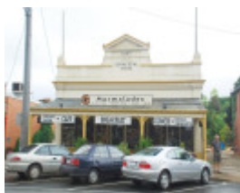
PURCELLS GENERAL STORE SOHE 2008