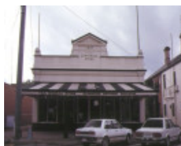
1 purcells general store high street yea front view apr1989