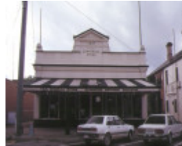
1 purcells general store high street yea front view apr1989