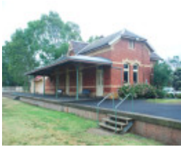
FORMER YEA RAILWAY STATION SOHE 2008