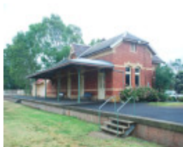
FORMER YEA RAILWAY STATION SOHE 2008