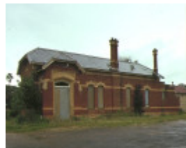
1 former yea railway station station street yea front view