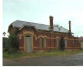
1 former yea railway station station street yea front view