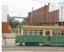
PRESTON TRAMWAY WORKSHOPS SOHE 2008