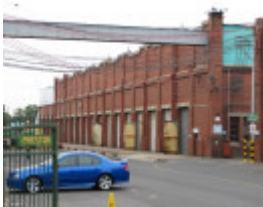
PRESTON TRAMWAY WORKSHOPS SOHE 2008