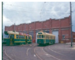
h02031 1 preston tramway workshops ext paint shop may03 aj