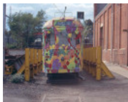
h02031 preston tramway workshops car straightening bay may03 aj