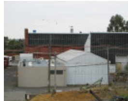
PRESTON TRAMWAY WORKSHOPS SOHE 2008