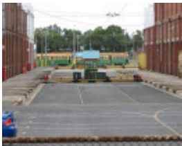
PRESTON TRAMWAY WORKSHOPS SOHE 2008