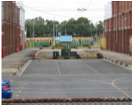
PRESTON TRAMWAY WORKSHOPS SOHE 2008