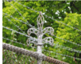
PRESTON TRAMWAY WORKSHOPS SOHE 2008