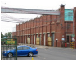
PRESTON TRAMWAY WORKSHOPS SOHE 2008