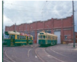
h02031 1 preston tramway workshops ext paint shop may03 aj