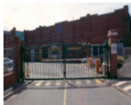
h02031 preston tramway workshops entry gates may03 aj