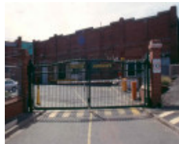
h02031 preston tramway workshops entry gates may03 aj