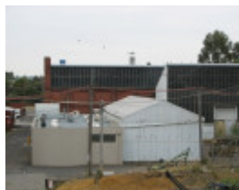
PRESTON TRAMWAY WORKSHOPS SOHE 2008