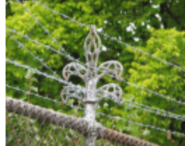
PRESTON TRAMWAY WORKSHOPS SOHE 2008