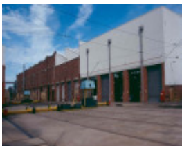
h02031 preston tramway workshops ext body shop may03 aj