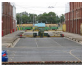
PRESTON TRAMWAY WORKSHOPS SOHE 2008