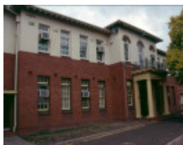
h02031 preston tramway workshops admin building may03 aj