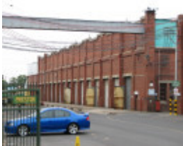
PRESTON TRAMWAY WORKSHOPS SOHE 2008