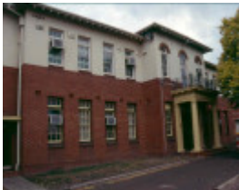
h02031 preston tramway workshops admin building may03 aj