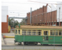
PRESTON TRAMWAY WORKSHOPS SOHE 2008