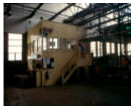
h02031 preston tramway workshops int foreman s office may03 aj