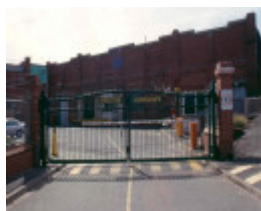
h02031 preston tramway workshops entry gates may03 aj