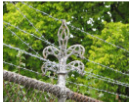
PRESTON TRAMWAY WORKSHOPS SOHE 2008