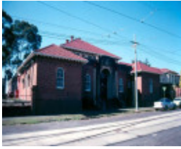
h02031 preston tramway workshops mess complex may03 aj