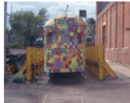
h02031 preston tramway workshops car straightening bay may03 aj