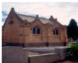
h02036 cussen memorial boroondara cemetery kew side