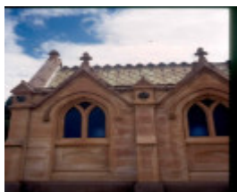
h02036 cussen memorial boroondara cemetery kew