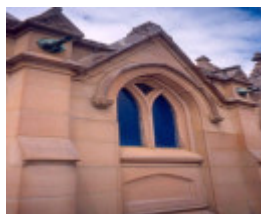
h02036 cussen memorial boroondara cemetery kew2 side