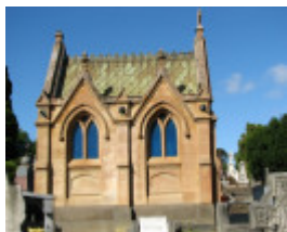
CUSSEN MEMORIAL, BOROONDARA GENERAL CEMETERY SOHE 2008