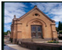
h02036 1cussen memorial boroondara cemetery