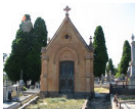
CUSSEN MEMORIAL, BOROONDARA GENERAL CEMETERY SOHE 2008