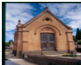
h02036 1cussen memorial boroondara cemetery