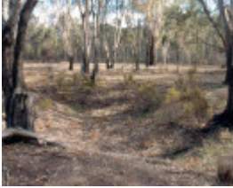
H02017 camerons saw mill site