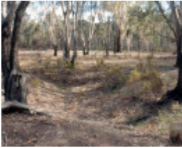
H02017 camerons saw mill site