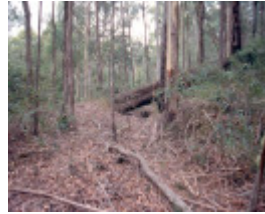
H02015 wheelers tramway