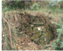
H02015 wheelers tramway retaining wall