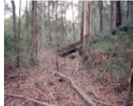
H02015 wheelers tramway