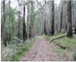
WHEELER'S TRAMWAY SOHE 2008