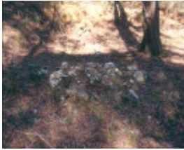
H02021 peter ah sen sawmill scatter