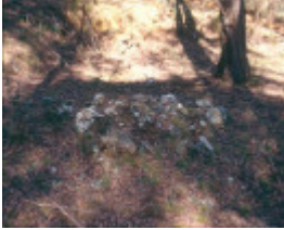
H02021 peter ah sen sawmill scatter