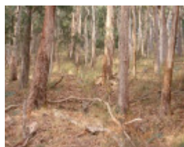
H02018 kozminskys mill and log chute chute