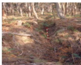
H02018 kozminskys mill and log chute mill site