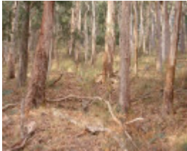
H02018 kozminskys mill and log chute chute