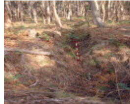
H02018 kozminskys mill and log chute mill site